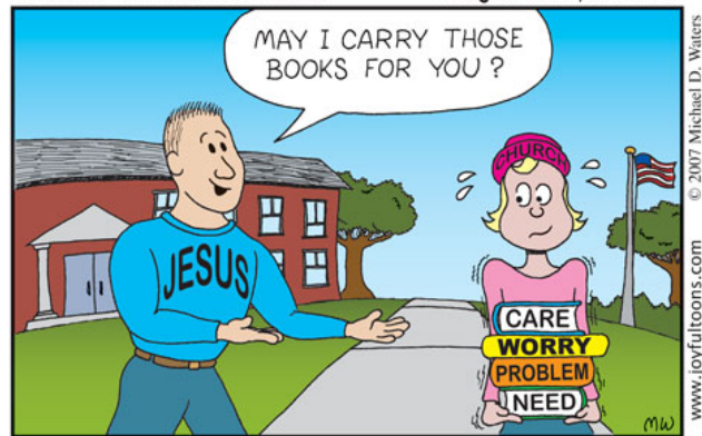
Casting all your care upon him; for he careth for you. -1 PETER 5:7 KJV